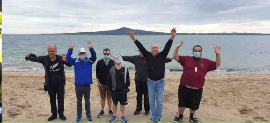
We are all looking forward to being back together again, getting out and about and having fun at the Activity Centre next week!

Dear Families, Students, Whanau and Friends,