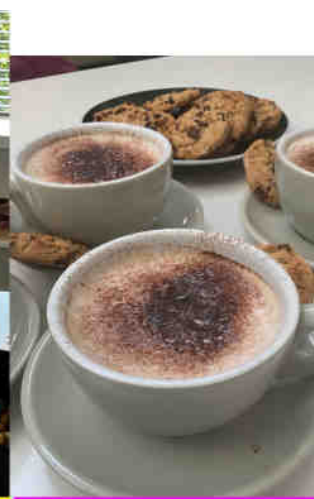
SENIORS MORNING TEA!