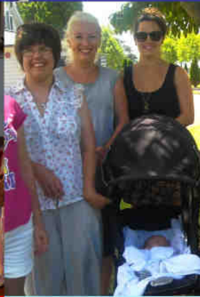
Special family memories for Poppy