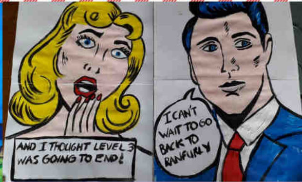
This week the art zoomers are creating their own pop art - join us on Friday to make your own