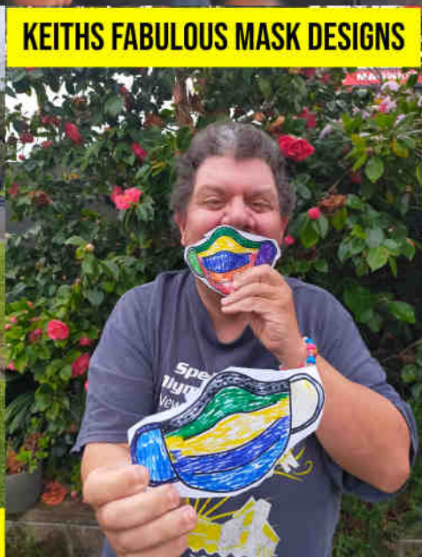
KEITHS FABULOUS MASK DESIGNS