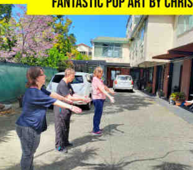
THE MEWS RESIDENTS KEEPING FIT IN THE SUN