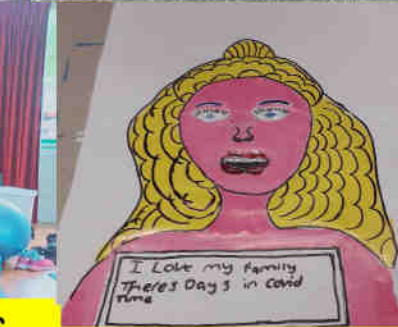
FANTASTIC POP ART BY CHRIS