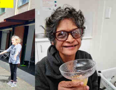
CHEERS FROM MUNIJA