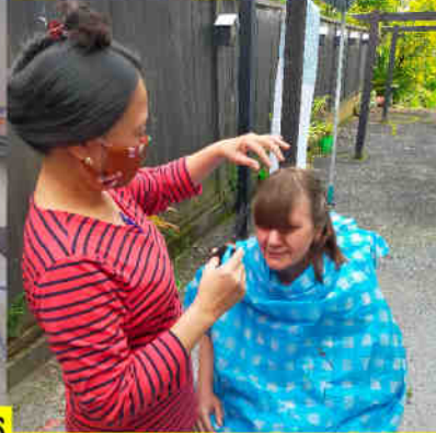
TIME FOR A FRINGE CUT! LOCKDOWN STYLIST