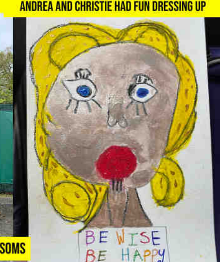
FANTASTIC POP ART BY BOBBIE