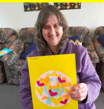
VICKI'S MANDALA ART