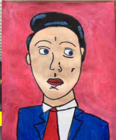
FANTASTIC POP ART BY BALDRIC