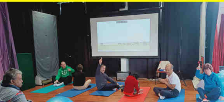
KEEPING FIT AND HEALTHY DOING YOGA AND LEARNING ABOUT ANIMALS