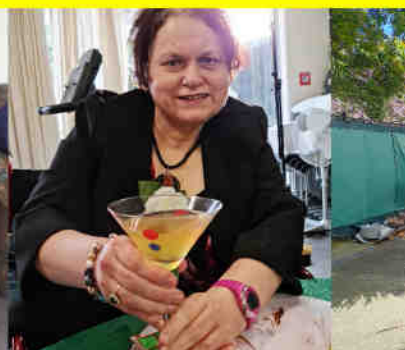
CELEBRATING IN STYLE!