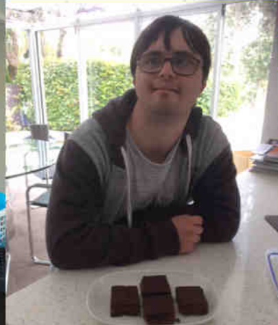
SCOTT'S FAVOURITE RECIPE HE MADE - BROWNIES