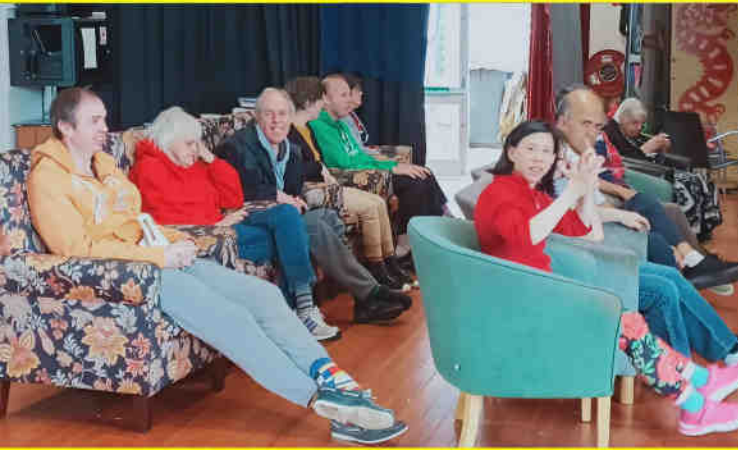
RANFURLY HOUSE RESIDENTS ENJOY THEIR CINEMA EXPERIENCE!