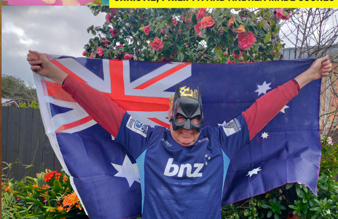
PETER CREATED A PORTRAIT PHOTOGRAPHY CHARACTER