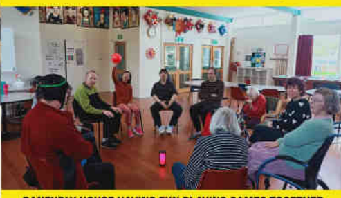
RANFURLY HOUSE HAVING FUN PLAYING GAMES TOGETHER