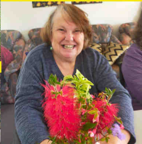
ANOTHER BEAUTIFUL SPRING BOUQUET