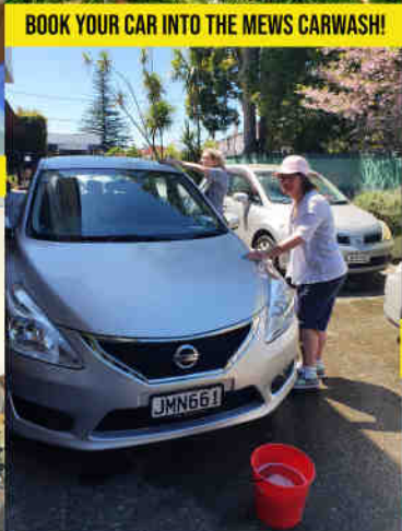
BOOK YOUR CAR INTO THE MEWS CARWASH!