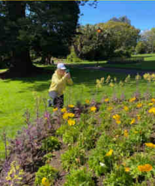
CAROLINE THE PHOTOGRAPHER IN ACTION