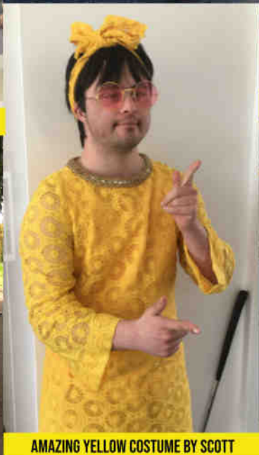
AMAZING YELLOW COSTUME BY SCOTT