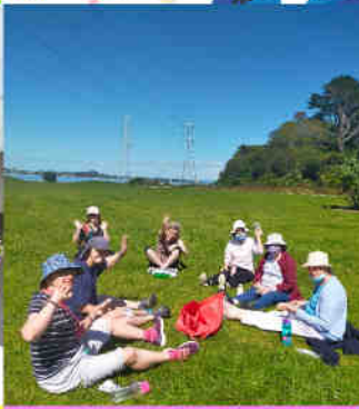
Mews residents enjoying a lovely picnic in the park