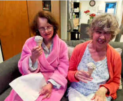
ICE CREAM TREATS!