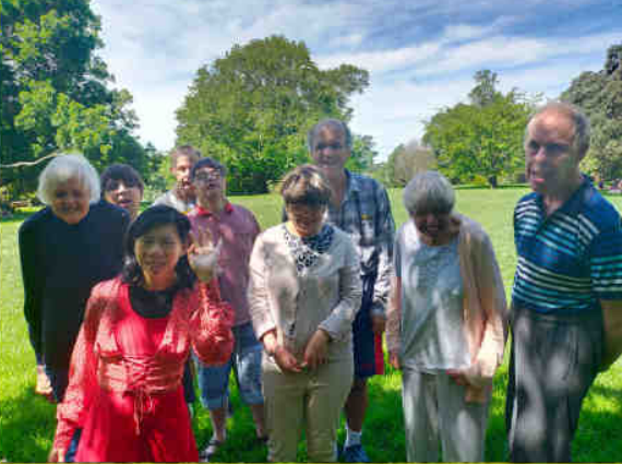
RANFURLY HOUSE RESIDENTS HAD A LOVELY PICNIC IN THE PARK