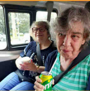
Labour Day Tiki Tour