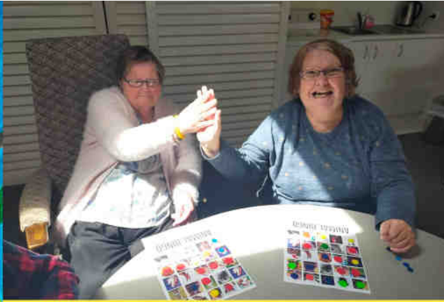
GOOD FUN PLAYING ANIMAL BINGO