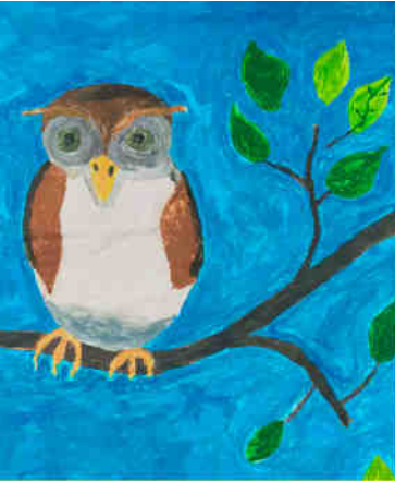
AMAZING RURU PAINTING BALDRIC