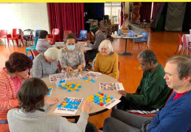
HAVING FUN PLAYING ANIMAL BINGO