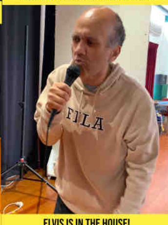
ELVIS IS IN THE HOUSE!