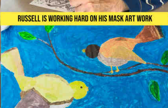
PIWAKAWAKA BIRDS BY BALDRIC