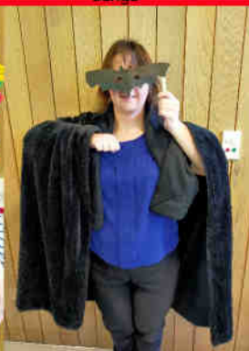
Christie the Bat