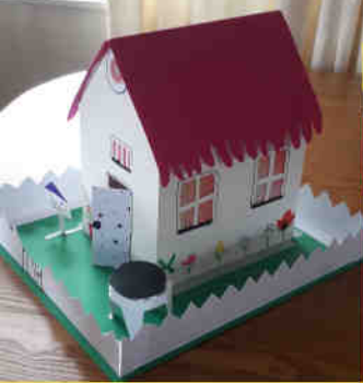
AMAZING HOUSE SCULPTURE BY CLARE