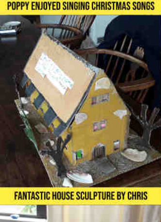
FANTASTIC HOUSE SCULPTURE BY CHRIS