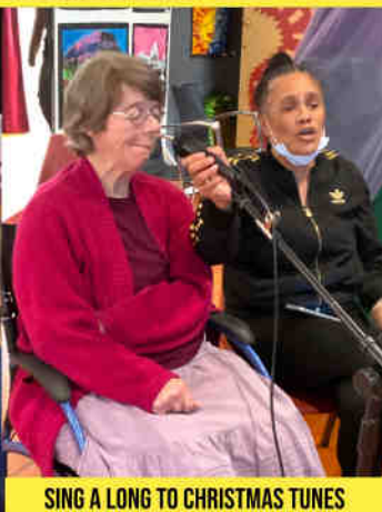
SING A LONG TO CHRISTMAS TUNES