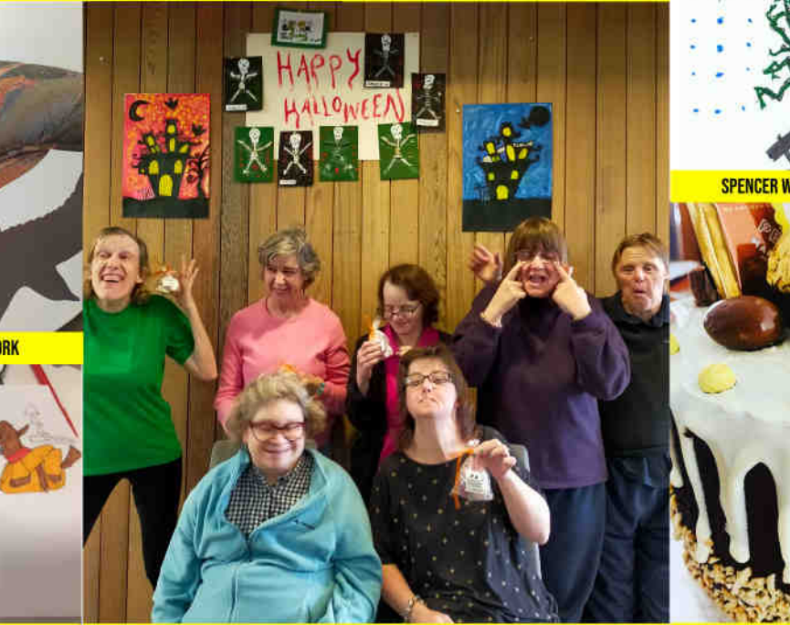
HAPPY HALLOWEEN FROM THE NEWS!