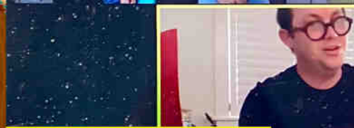
CORNWALL PARK RESIDENTS ENJOYED A ZOOM SING-ALONG