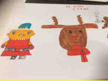
SCOTT IS IN CHRISTMAS ART MAKING MODE - GREAT DRAWINGS!