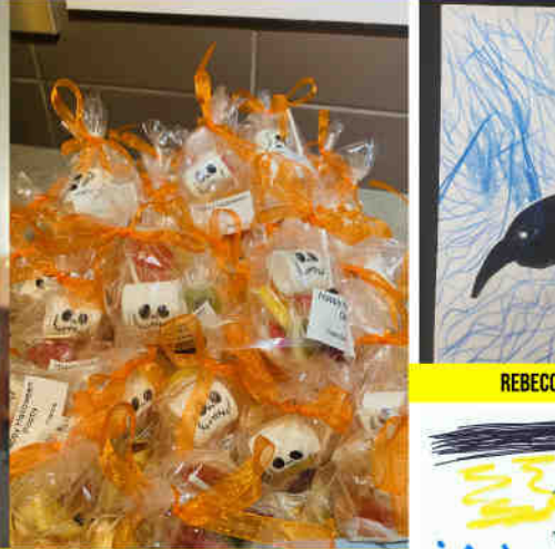
YUMMY TREATS FROM DIANNE!