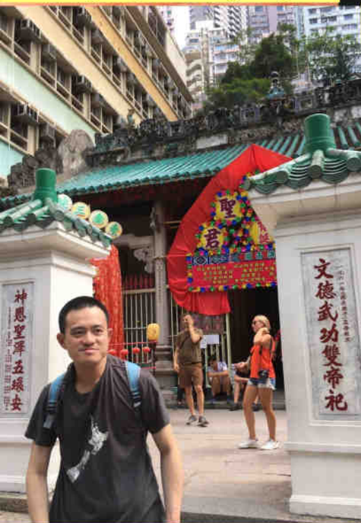
Ping enjoying Hong Kong