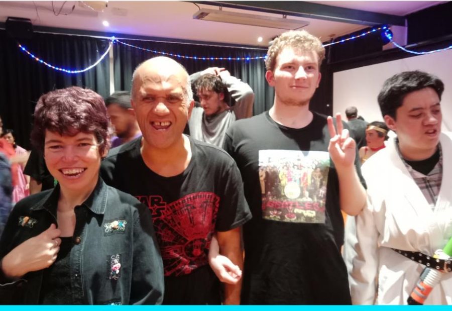
Good times at the Special Olympics Disco