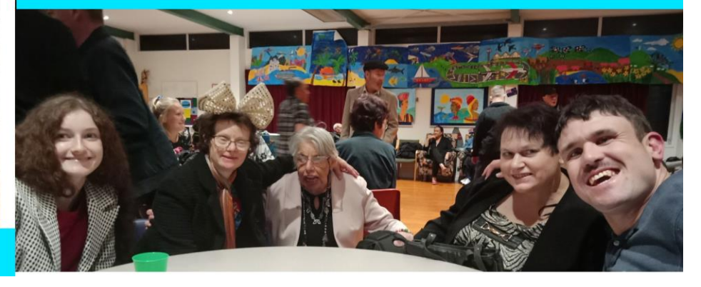
Our Favourite Pub!