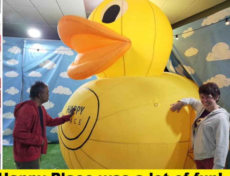
The Happy Place was a lot of fun!