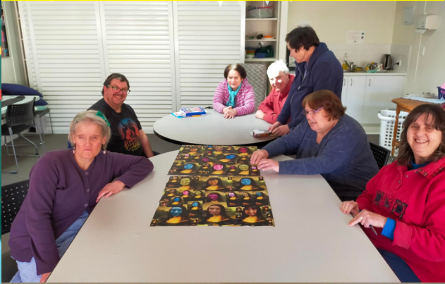
CPA RESIDENTS MADE MONA LISA POSTERS