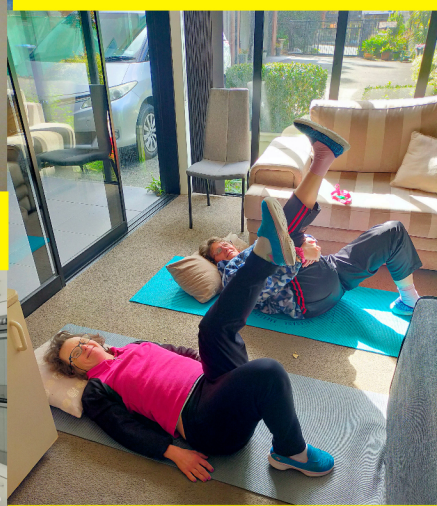
A BIT OF YOGA TO KEEP FIT!