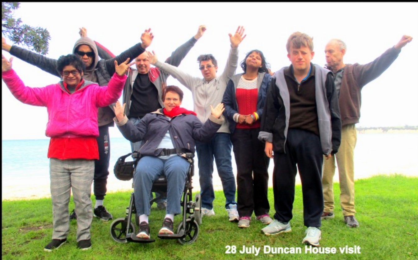
28 July Duncan House visit