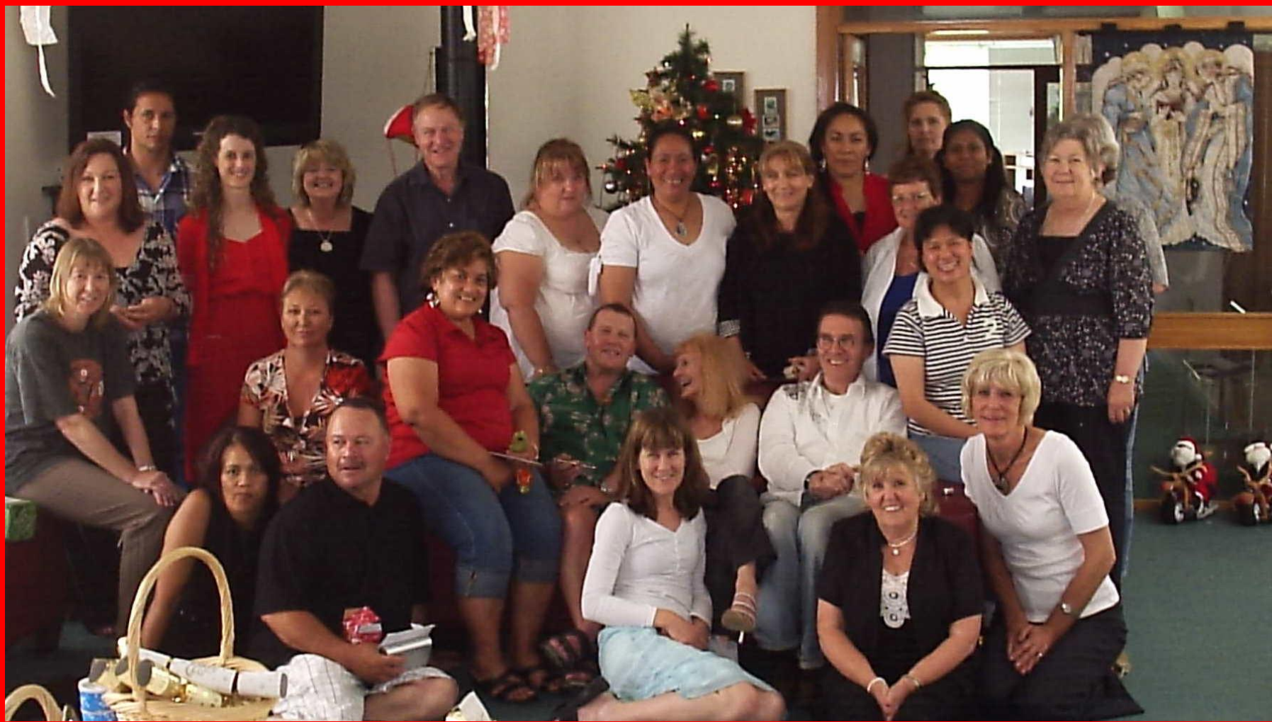
Some of our staff at the Christmas Luncheon December 2008

Merry Christmas to You All from the Ranfurly Staff